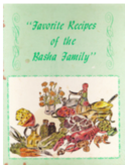
Favorite Recipes of the Basha Family