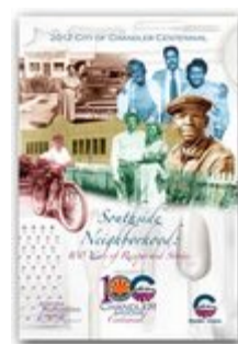
Southside Neighborhood: 100 Years of Stories and Recipes