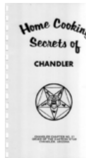
Home Cooking Secrets of Chandler